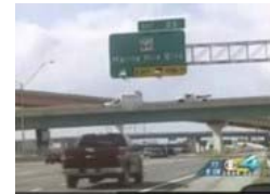
1 of 1 Click to enlarge

Suggest Link Link * e.g. ( http://www.mywebsite.com )